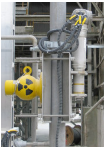
Source Container and Gammapiilot M FMG60