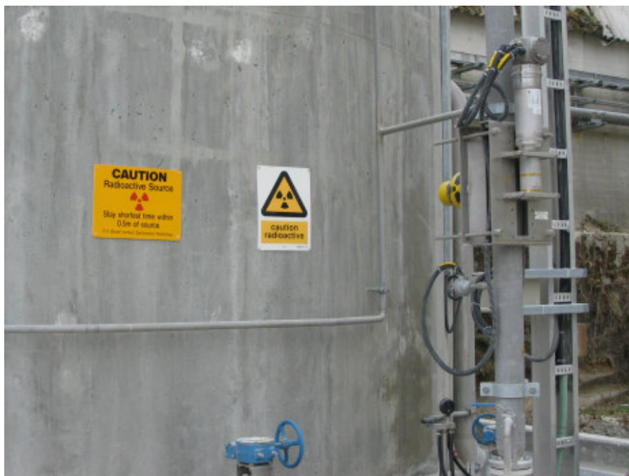
Gammapiilot M FMG60 installation on a NZ Pulp and Paper application